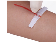
Figure 3 - Place