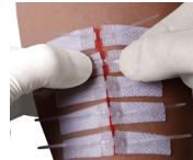
Figure 4 - Pull