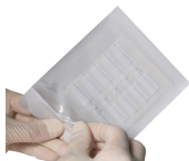
Figure 1 - Open