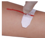
Figure 3 - Place

To manually check if the devices are locked, simply push down on the top center of each device. When