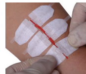
Figure 4 - Pull

the device is properly locked, the device remains rigid and everted when the top center is pushed down, with the faces remaining in full contact. If the device is not locked, the center of the device will be pushed down and out. The tabs on any device not properly locked should be re-pulled to achieve proper locking of the device.