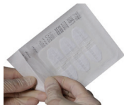
Figure 1 - Open