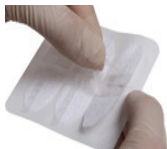
Figure 2 - Pick