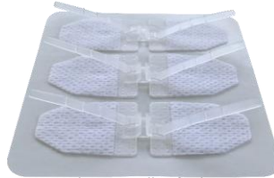
1 Package, 3" of Closure 1 Box = 12 Pkg with 3 Clips