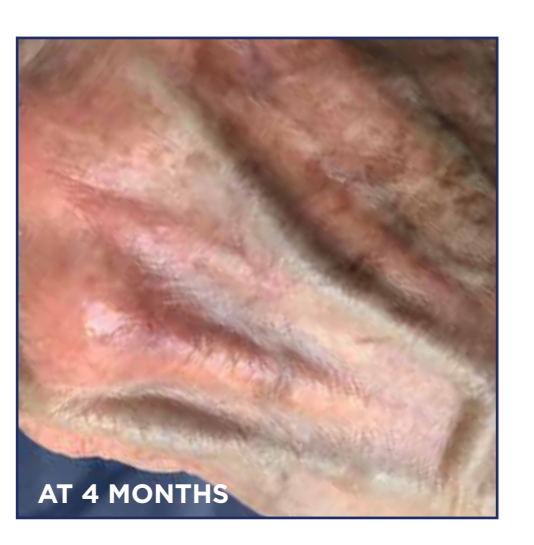
3" skin tear, 79 y.o. patient on blood thinners

DermaClip brought hemostasis, handled oozing and achieved great cosmesis